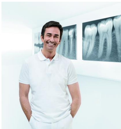
Fig. 1: Intra-oral X-rays form the basis for diagnostics for many indications and can be integrated easily, quickly and safely into a digital workflow.