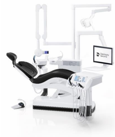
Fig. 3: Digital networking and integrated functions – the complete package in the new generation of treatment centers from Dentsply Sirona. Teneo can be equipped with the intraoral X-ray source Heliodent Plus and the Sivation 22" monitor.